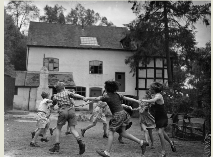
International School- Life at Pauntley Court, a School and Home For French and Belgian Refugees, Pauntley, Gloucestershire, 1943

As the collective evolves, it continues to expand and complete itself, with each new member contributing to and adding to this ever-growing puzzle. Their presence brings fresh perspectives and expertise, ensuring that the collective remains dynamic, innovative, and reflective of a diverse range of artistic expressions. Participation is fluid, with members joining or leaving as needed for each project, keeping the collective innovative, flexible, and committed to inclusive, collaborative art and teamwork.